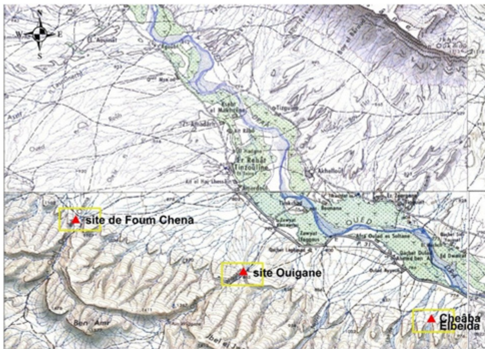
Figure 2. Location of the rock engravings sites of Tinzouline (Topographic map of El Gloa, scale 1/100,000) from Beraouz (2011).