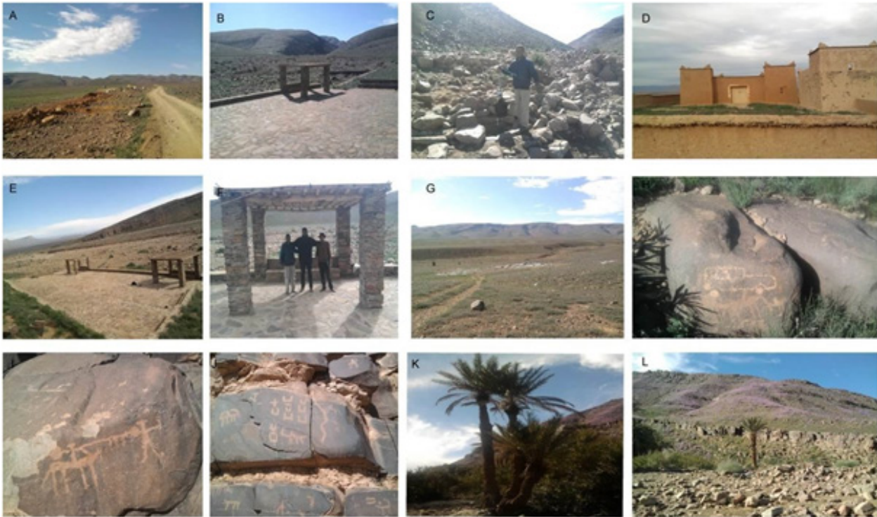
Figure 3. View of site of Foug Chenna. (a) The road to the site; (b, e, f) The new interpretation Centre built by the Moroccan Ministry of Culture and some Executive Board of the association; (c) This well, dug in 2013, with a depth of 10 meters, allows tribes, nomadic or sedentary, to maintain their traditional way of life. Equipped to draw drinking water, it also includes a trough for animals (camels, goats, and sheep) in the region or in transhumance; (g, h) threat of destruction by human activities (disfigurement and rubbish); (i, j) Selection of engravings from Foug Chenna (Horseman, leopard/lion, Libyco-Berber letters, animals, ostrich, etc) and; (k, l) Natural landscape in the Foug Chenna (date palms).

The mounted horse and the ancient Libyan alphabet are important elements for the establishment of a chronology of Moroccan rock art (Searight 2001; Heckendorf 2008 a, b), discovering and applying new techniques to understand motif styles and their chronology is necessary for the Foug Chenna site (For more information about the methodology for dating the rock art, see Bednarik 2002). Both pecked and polished techniques were used. Patination varies from complete (the same color as the supporting rock) through medium to fresh. In general, the engravings are small, 30-50 cm. No image larger than 1 m was noted (Bravin 2014). Not far from Foug Chenna site, there are two other sites in the area, in the same style and the same period, namely Assif Ouigane and Jorf Al Khalil (Fig. 2). The latter contains about a hundred engravings, mainly of horsemen, horseshoes and jewelery, including fibula and little circles which could be interpreted as bracelets (El Graoui 2005). The last advances in the studies of Foug Chenna rock art (e.g., Abioui et al. 2018; Beraaouz et al. 2017; Bouzid et al. 2012; Beraaouz 2011) provide additional and better data, which are also taken into consideration in this study. The Foug Chenna locality is an excellent example of a rock art site which has been very effectively interpreted for public viewing, geotourism and geoeducation.